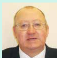
Derek G. Atkinson Lab - Tel. 301395