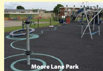
Moore Lane Park