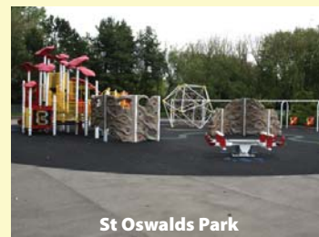
St Oswalds Park