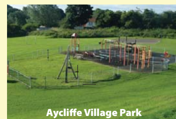
Aycliffe Village Park