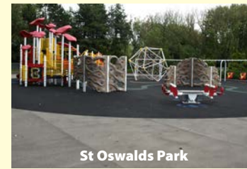
St Oswalds Park