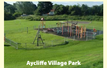
Aycliffe Village Park