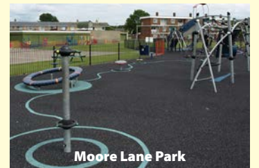
Moore Lane Park