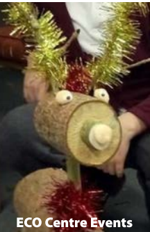
ECO Centre Events