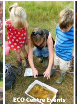
ECO Centre Events