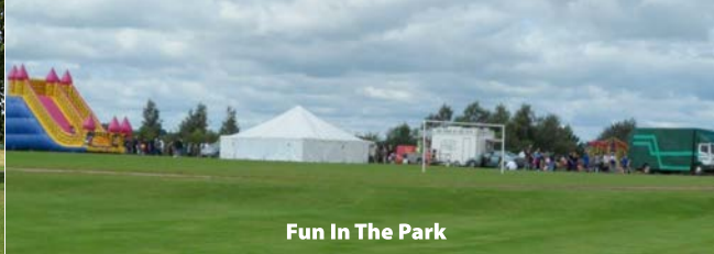
Fun In The Park