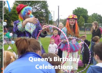
Queen's Birthday Celebrations