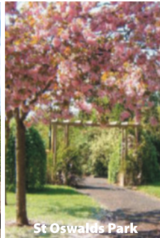
St Oswalds Park