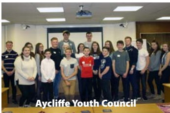
Aycliffe Youth Council

Civic Service, Civic Dinner, 'At Home', Golf Tournament & Carol Service