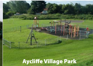
Aycliffe Village Park