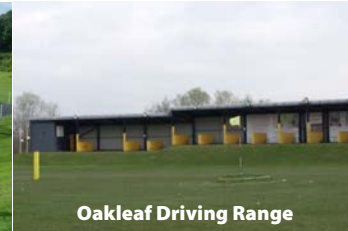
Oakleaf Driving Range