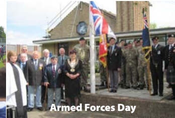
Armed Forces Day