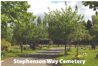
Stephenson Way Cemetery