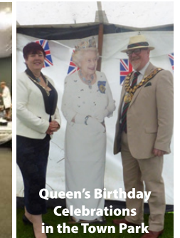
Queen's Birthday Celebrations in the Town Park