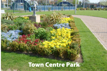
Town Centre Park