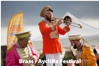
Brass Aycliffe Festival