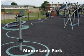
Moore Lane Park