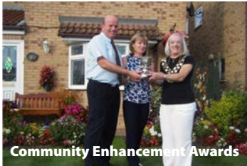
Community Enhancement Awards