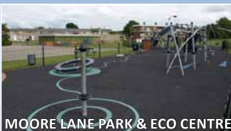
MOORE LANE PARK & ECO CENTRE

Infant and Junior Play Areas, Multi Use Games Area