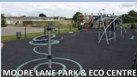
MOORE LANE PARK & ECO CENTRE

Infant and Junior Play Areas, Multi Use Games Area