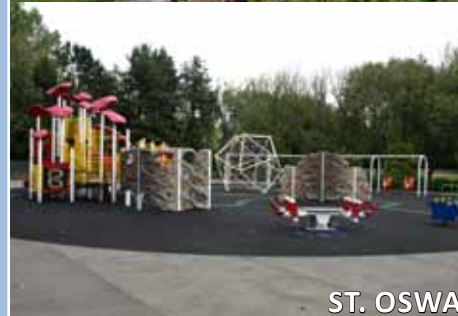
ST. OSWALD'S PARK

Infant and Junior Play Areas, Home of the Eco Centre