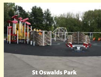
St Oswalds Park