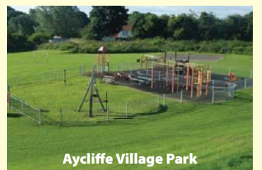
Aycliffe Village Park