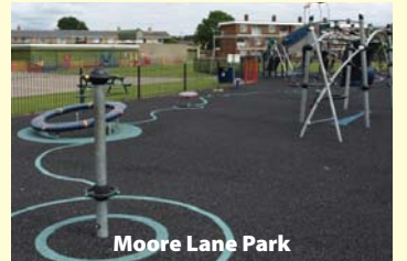
Moore Lane Park