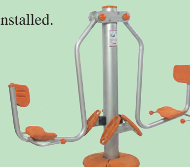
Double Leg Press

A partnership between Great Aycliffe Town Council, Durham County Council and the Great Aycliffe and Middridge Area Action Partnership (GAMP) will be providing and installing a range of new outdoor fitness equipment in West Park, Newton Aycliffe, aimed at improving general health and fitness levels. An extensive public consultation exercise revealed a need for an alternative to indoor, gym-style membership, which would be free to use. The equipment is generally aimed at ages from 14 and above.