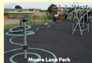
Moore Lane Park