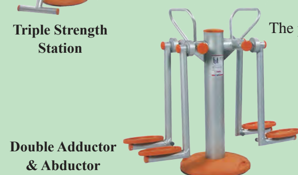
Double Adductor & Abductor