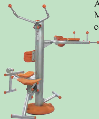
Triple Strength Station