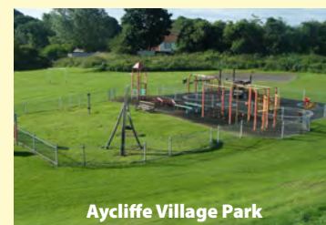
Aycliffe Village Park